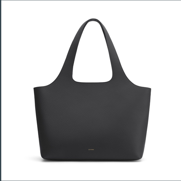
Cuyana System Tote Bag