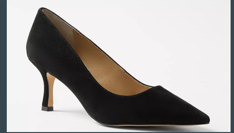
Classic Low-Heel Pump