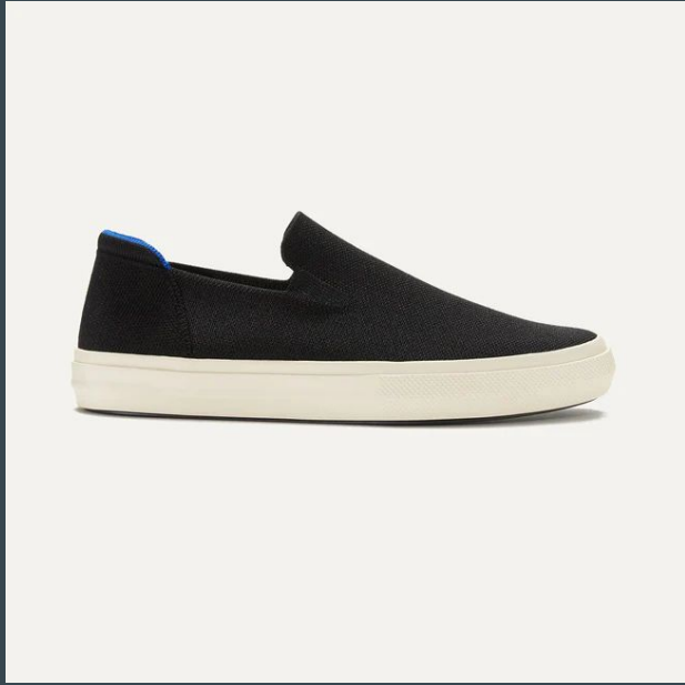
Rothy Slip-On Sneaker