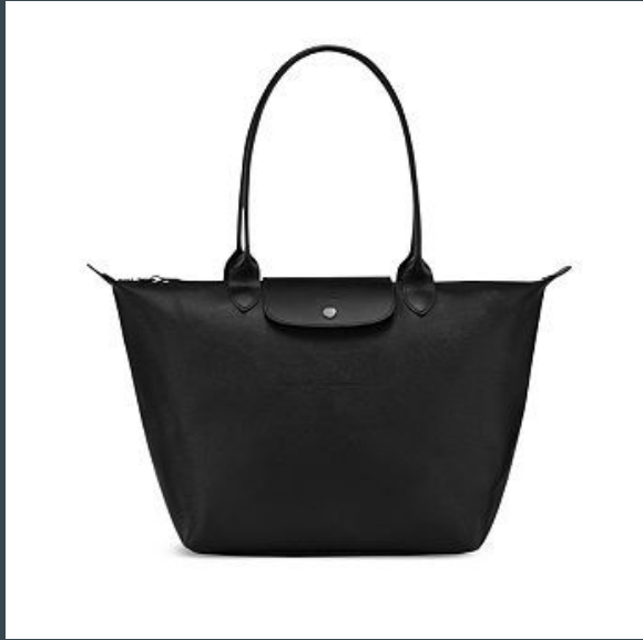
Longchamp Tote (all black)